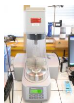
MCR 301 Rheometer T°C : 5°C to 200°C