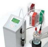
PHSTAT : measures lipase activity