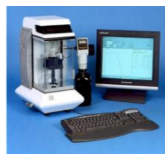
3S GBX Tensiometer T°C: 10 to 100°C

Emulsions or suspensions / integrated camera 3 Achromatic oil immersion brightfield objectives: 10x/0,25, 40x/0,65, et 100x/1,25, infinity corrected, (ICS), brightfield, phase-contrast, trinocular version.