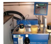
ISL Cold flow properties analyzer (with - 80°C cryostat)

Automatically measures the time required for a liquid to flow through a tube in order to determine relative and kinematic viscosity. T°C : 20 to 60°C